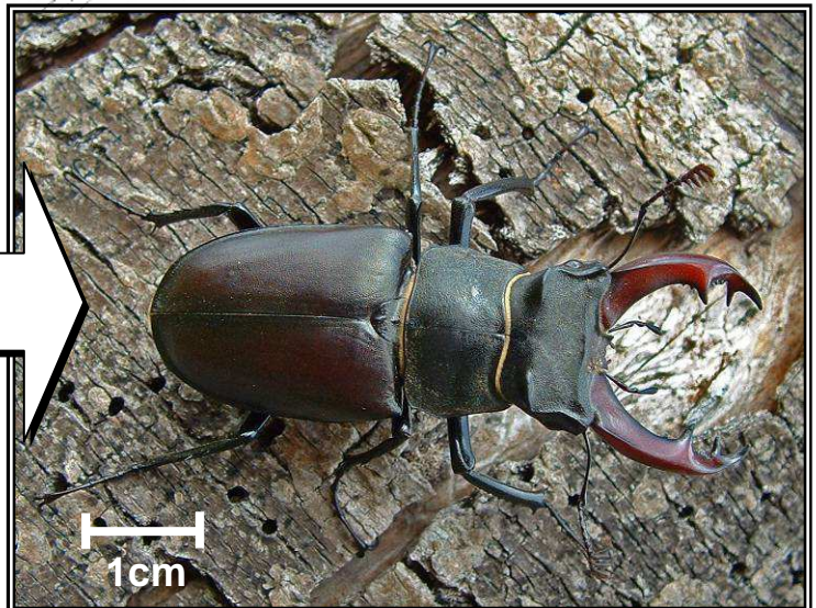
A male Stag Beetle – the jaws are far too weak to hurt humans and are only used to fight other male Stag Beetles.